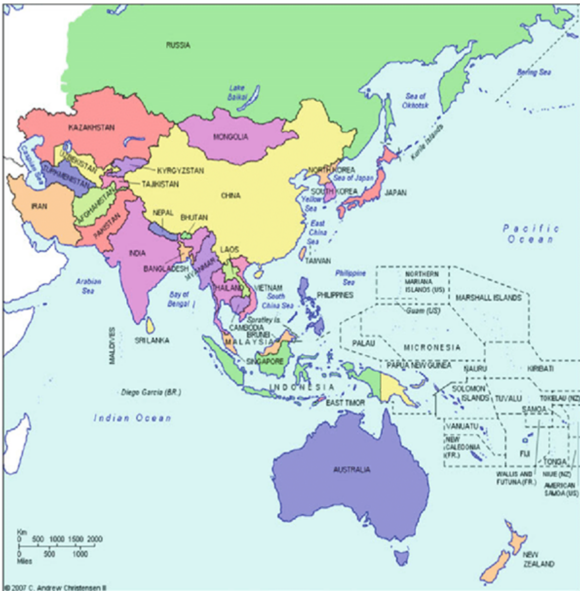
Figure: Map of the Asia-Pacific