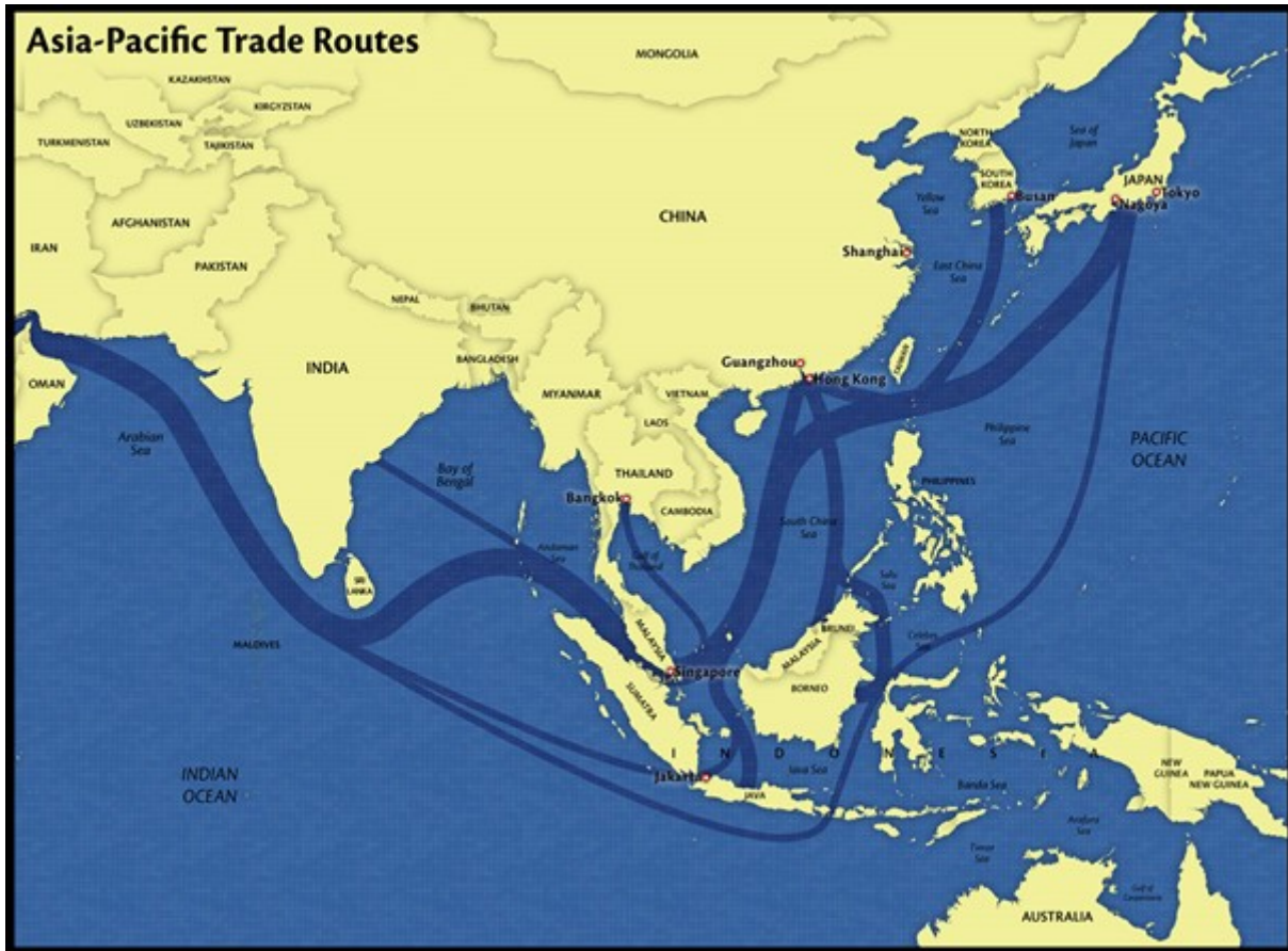
Figure: Asia-Pacific's Trade Road