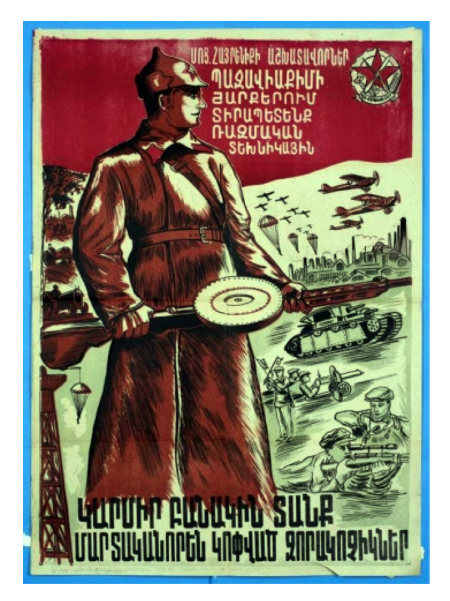
Poster 2. Propaganda Poster on War Training<sup>45</sup>

The propaganda poster on war training was prepared by Ashot Petros Mamajanyan. The poster is dated between 1927-1951 years. When examined in terms of denotation meaning, a man wearing a Red Army uniform holding a machine gun is depicted on the poster. Tractors plowing a field are behind the man and planes, parachutes, a tank, and civilians standing at the head of weapons are in front of him. The color red is used in the background of the poster. There is an inscription stating "We give to the Red Army strong conscripts for combat" ( 4upt/pp pubul/pb unulp uupnul/uupbul/ubp) " on the poster.