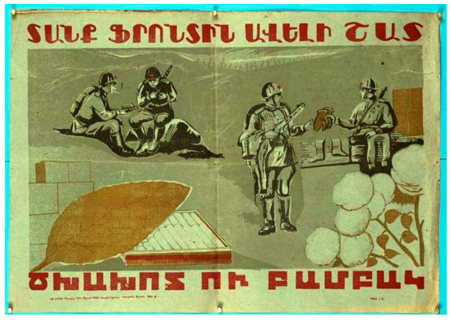
Poster 6. Propaganda Poster on the Front<sup>49</sup>

The propaganda poster on the front was prepared in 1944, but like the previous poster, it is unknown who prepared this poster. When examined in terms of denotation meaning, tobacco and cotton images are highlighted in the poster. In the background of the poster, two soldiers smoke on the left side and one soldier gives clothes to another soldier on the right. There is an inscription stating "We will give more tobacco and cotton to the front" (Suulp &pnunhu uulla puulpulu)" on the poster.