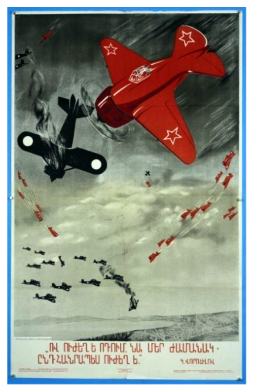
Poster 4. Propaganda Poster on the Air Force<sup>47</sup>

The propaganda poster on the air force was prepared by Andrey Borisovich Yumashev, Viktor Nikolaevich Deni, and Nikolai Andreevich Dolgorukov in 1940. When examined in terms of denotation meaning, black and red airplanes are depicted in the air on the poster. In the foreground of the poster, one of the red airplanes goes over a black plane. The black plane crashes and smoke rises from it. There are star symbols on the red plane. In the poster, there is an inscription stating "Who is strong in the air is strong in our time.' K. Voroshilov" (" \Omega \eta niden \xi nnnid, hu den duduhuh phnhuhpunghu niden k" 4. 4npn2hpn4) on the poster.