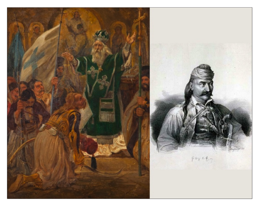
Pictures: (Left) Archbishop Germanos III of Old Patras, whose slogan for the Greek rebellion was "Peace to the Christians! Respect to the Consuls! Death to the Turks!" / (Right) Guerilla leader Theodoros Kolokotronis, the ultimate symbol of the Greek independence, who played a leading role in the extermination of the Turks of Morea.

25 March of this year was a symbolic day for Greece as it marked the 200th anniversary of Greek independence. Yet, 25 March was not only the anniversary of the Greek independence, but also the annihilation of the Turks of Peloponnese (also known as Morea) and the surrounding areas who were wiped out in a matter of weeks.