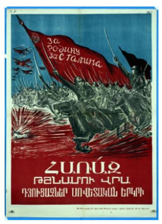
Poster 5. Propaganda Poster on the Enemy<sup>48</sup>

This is a poster steeped in communist elements. When analyzed in terms of connotation, the poster gives the message of the Red Army as the protector power of communism. The soldiers on the poster are used as the metonym of the Armenian people who have joined the Red Army. The red flags on the poster symbolize the ideology of communism. The development of the defense industry is demonstrated by the aircraft. It refers to air military support for the Red Army. The poster shows the inscription on the flag they carry while the Red Army is fighting for the homeland. It is also significant that the strong message is now written in Russian because Armenia remained a member of the SU at the end of 1920. The planners of the propaganda must have calculated that the Armenian people could speak, read, and write Russian. On the other hand, through the visual sings, a perception is inadvertently formed that the Red Army is struggling to maintain the ideology of communism. Overall, the propaganda myth that "communism could be threatened without the Red Army" is built on the poster. In this way, the perception is formed that the Red Army's defense of communism is the defense of Armenia. Information from the poster shows that the Red Army is a force ready to fight. On the other hand, the poster also highlights Stalin's personality cult.