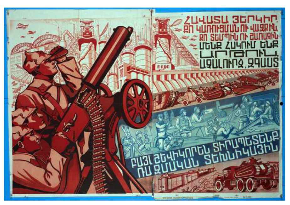
Poster 1. Propaganda Poster on Military Equipment<sup>44</sup>

Security and power issues come to the fore as signified in the poster. When analyzed in terms of connotation, the message that the Red Army protects Armenia is given in the poster. The soldiers in the poster are used as the metonym of the Armenian people joining the Red Army. The production plant (or dam) symbolizes the production in Armenia. The armored vehicles, tanks, and planes featured in the poster constitute the perception that the Red Army is equipped in terms of military hardware and that the Red Army is ready for any attack against Armenia. The Red Army is used as a metaphor for both power and security in the poster. The poster gives the message that the strength of the Red Army is important for the security of Armenia. In this respect, the poster constructs the propaganda myth that "The strength of the Red Army is the strength of Armenia". Through this myth, Armenians are called upon to improve themselves within the Red Army so that Armenia can be a strong country.