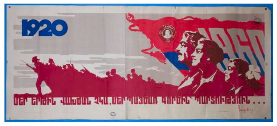
Poster 7. Propaganda Poster on Celebration<sup>50</sup>

of the poster is a dynamic army unit armed with a rifle with a bayonet attachment, on the right side is a student girl, a woman with her hair carefully collected, and a man with a strong expression just to her right. Behind the girl, woman, and the man is the flag of the Red Army with the coat of arms of Lenin. The flag being waved shows the year 1960, signifying the 40th anniversary of the Armenian SSR.