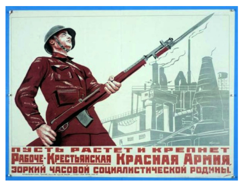
Poster 3. Propaganda Poster on Socialist Homeland<sup>46</sup>

The content of this poster bears resemblances to the previous two posters. Security comes to the fore as the signified in the poster. When examined in terms of connotation meaning, the poster gives the message that the Red Army is the guarantee of the safety of production. The soldier in the poster is used as the metonym of the Armenian people joining the Red Army. The production plant in the poster also symbolizes the production in Armenia. The poster creates the perception that the Red Army is the guarantee of Armenia's security. Red Army is used as a security metaphor in the poster. The propaganda myth "The Red Army protects the gains of the Armenian people" is constructed in the poster, and the Armenians are thus encouraged to support the Red Army through the myth.