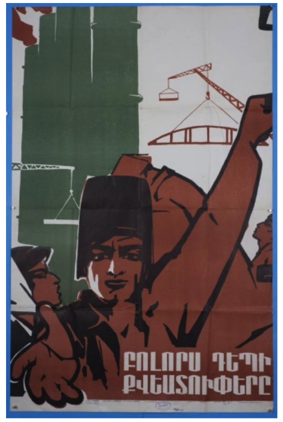
Poster 4: The Fourth Poster<sup>43</sup>

The fourth election poster was prepared by Aram Boris Zakarian and was published in 1964-1965. Considered syntactically, the poster depicts a group of people in front of a factory. A man in the poster raises one hand in the air and invites people from the poster with the other hand. A figure resembling a woman wearing white scarf over her cap with a determined facial expression stands on the left corner. The poster reads "Let us all go to the voting booths (Բոլորս դեպի քվեատուփերը)".