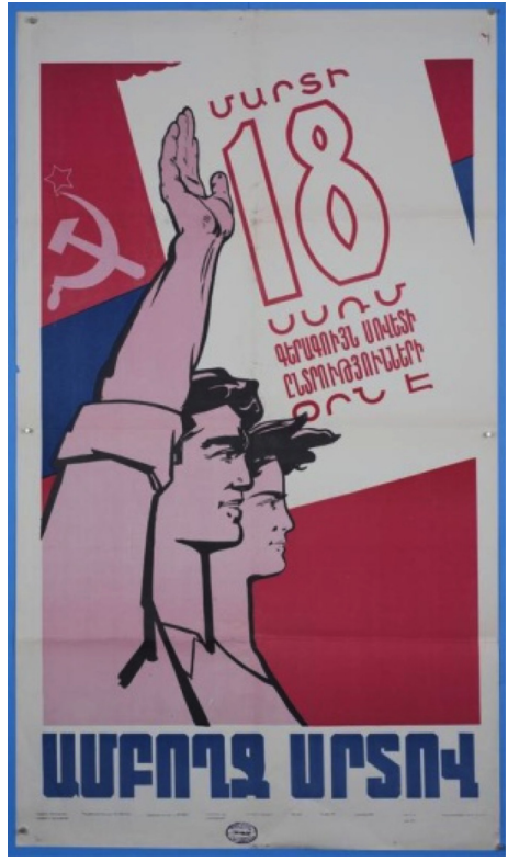
Poster 3: The Third Poster<sup>41</sup>

When considered in terms of semantics, the flag on the poster symbolizes ASSR. The two smiling men in the poster are used as the metonymy of the Armenian people.