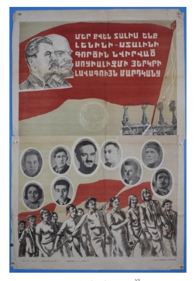
Poster 1: The First Poster<sup>37</sup>

The first election poster was prepared by Sedrak Tigrani Rashmadzyan and Manuk Vakhtangi Arutyunyan and was published in 1937. When analyzed syntactically, the poster features images of Soviet leaders Vladimir Lenin and Joseph Stalin on a red flag. The poster depicts a group of people carrying red flags and walking while smiling under the red flag. In the middle of the poster, there is a picture of a group of people. In the background of the poster, there are images of structures resembling production facilities. The poster reads "We give our votes to the bright people dedicated to the cause of Lenin and Stalin (Մեր քվեն տայիս ենք Լենինի -Ստայինի գործին նվիրված սոցիալիզմի լերկրի լավագույն մարդկանց)".