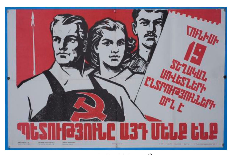
Poster 8: The Eighth Poster 49

The eighth and final election poster was prepared by Daniel Davidi Sargsyan. Information about its preparation date is not available. When considered syntactically, a woman and two men are depicted on the poster. One of the men in the poster wears a working overall with a sickle and hammer. A fighter jet taking off, or a missile or a rocket being launched is depicted in the background of the poster. The poster reads "June 19 is the day of local council elections (Հունիսի 19 տեղական սովետների ընտրությունների օրն է)" and "The government - that is us! (Պետությունը այդ մենք ենքը)".