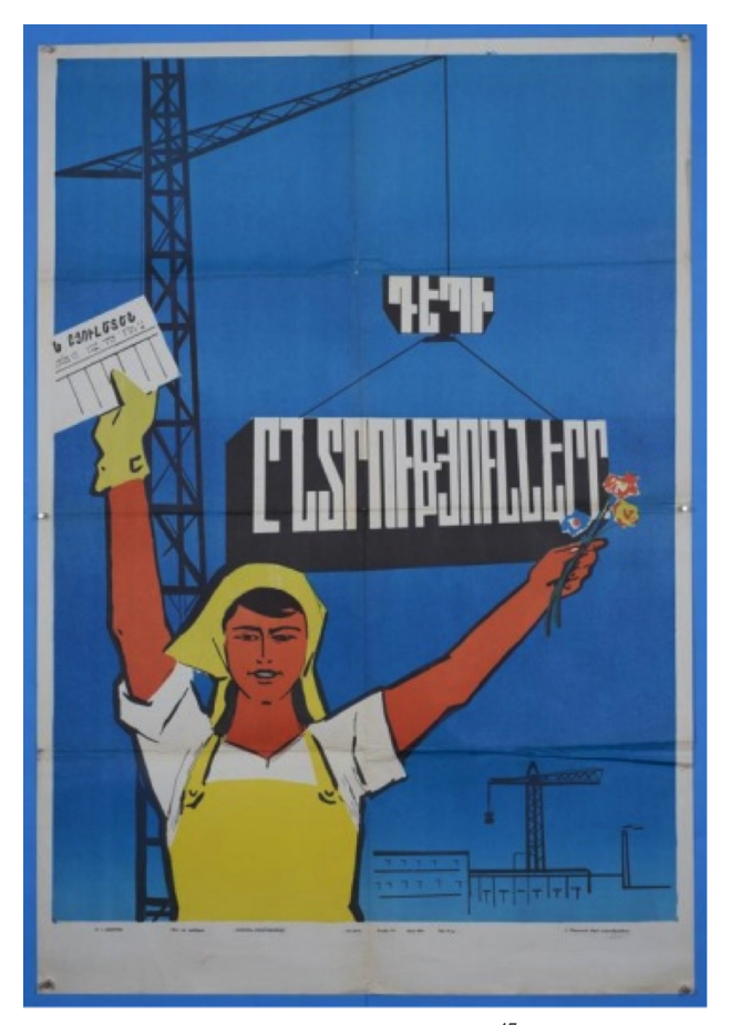
Poster 6: The Sixth Poster<sup>47</sup>

The sixth election poster was prepared by E. Khachatryan and was published sometime between 1970 and 1980. Considered syntactically, the poster features a woman in a worker's outfit holding a card in one hand and flowers in the other. In the background of the poster, a factory, a shipyard, a construction site or a similar place is depicted. The poster reads "Towards the Elections (Դեպի րնտրությունները)".