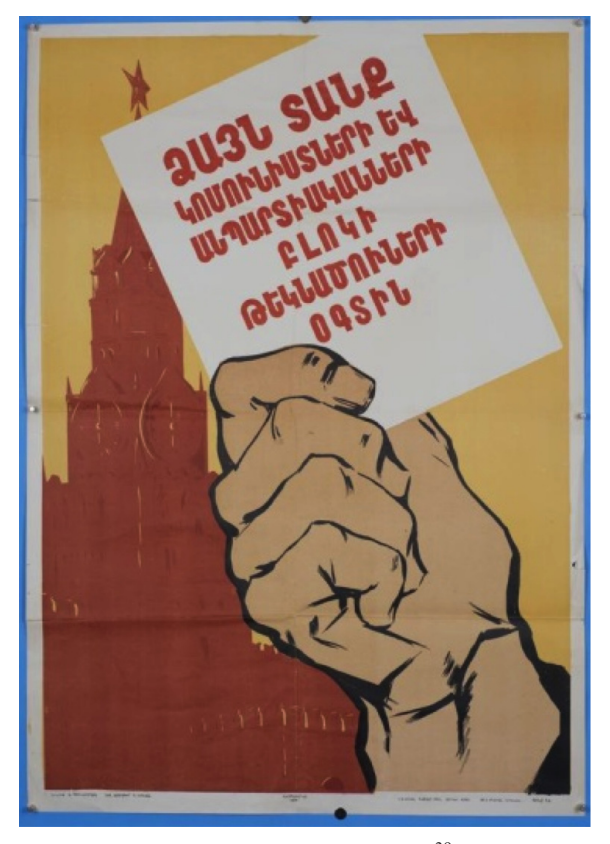
Poster 2: The Second Poster<sup>39</sup>

The second election poster was prepared by Khachatur Hovhannesi Gyulamiryan and was published in 1958. Taken in the syntactic dimension, the poster depicts a hand holding a white card. On the back of the hand on the poster, the Kremlin is depicted in red. The poster reads "Let's vote for the communist candidates... (Ձայն տանք կոմունիստների և անպարտիականների բլոկի թեկնածուների օգտին)".