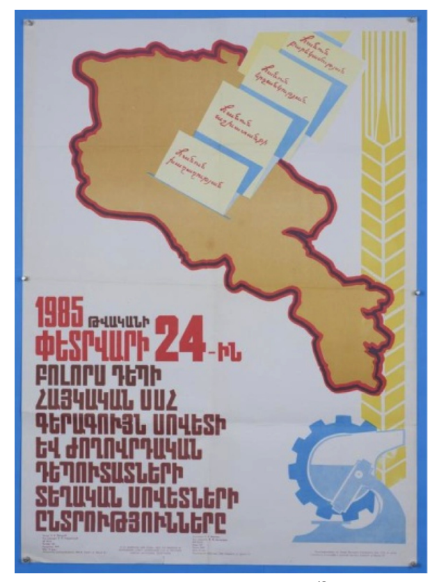
Poster 7: The Seventh Poster 48

When considered in terms of semantics, a message that the Armenian people go to the elections is given from the written and visual indicators on the poster. The spike in the poster symbolizes agricultural production in Armenia, the machine gear symbolizes industrial production in Armenia, and the laboratory tube and microscope symbolize scientific endeavors in Armenia.